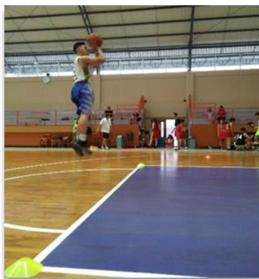
Figure 1. Jump Shoot Basketball Movement

To score a number in a competition the technique most commonly used is Jump shoot or shot followed by a jump. Jump shoot movements that are easy to do even though there are several phases of motion carried out include jumping, hand movements in shooting, eyes focused on the target and continued movements to release the ball (Kosasih, 2008: 45). When jump shoot for a basketball, the player must jump up and push a strong arm and aim at the target. This requires strength, leg muscle strength and good arm muscles, so that the expected goals are achieved.