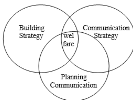
Figure 1. Relationship between Building Strategies, Communication Strategies and Communication Planning

Communication planning needs to be considered when carrying out development, so that the strategies used to convey the message will be more effective. Communication planning in development functions to analyze the strategies carried out. Communication planning is closely related to determining the methods used to communicate the message, whether through certain media and so on, so that the contents of the message delivered can make a change. The link between communication planning, strategy and goal achievement has an inseparable unity as illustrated below. Effective communication strategies related to communication planning. Everett M. Rogers (1985) mentions that communication is the basis of a nation's social change. Communication is seen as an extension of government planners and its main function is to get community support and their participation in implementing development plans. 8