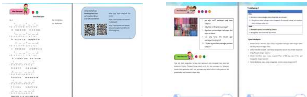
Figure 3. Example of multiple intelligence activity section

The thought activity contains the development of student's multiple intelligence consist of linguistic intelligence, musical intelligence, logical mathematic, visual-intelligence, spatial intelligence, kinesthetic intelligence, interpersonal intelligence, naturalist intelligence. Beside that, the content of learning material based on local wisdom like art, culture, plant, fruit and many more.