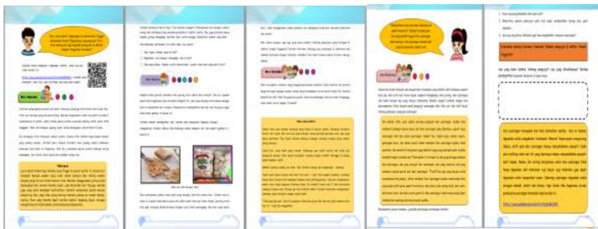
Figure 2. Example of high order thinking skills activity section

In this activity, students are invited to observe and absorb information in a text that is equipped with various data and realities in everyday life. In this section, students will reveal various facts associated with the experiences of their daily lives. Students are asked to apply what is in the teaching material to their daily lives and to dig at what problems are available in information and to dig at solutions to the problems. High order thinking skill consists of extracting information by locating veracity or facts, producing interpretation, analysis, evaluation, and inference, as well as exposure using evidence and setting the best criteria for making decisions: