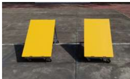
Figure 2. The final product of the Smash Training Aid Media

Based on the results of large group trials from the results of the feasibility validation analysis of the assistive media revised by media expert lecturers and volleyball sports experts with several aspects in each questionnaire, the percentage value of media experts was obtained as 98.07% and the percentage value of volleyball sports experts is 97.5% with a decent category, The end of this research and development is the right to patent.